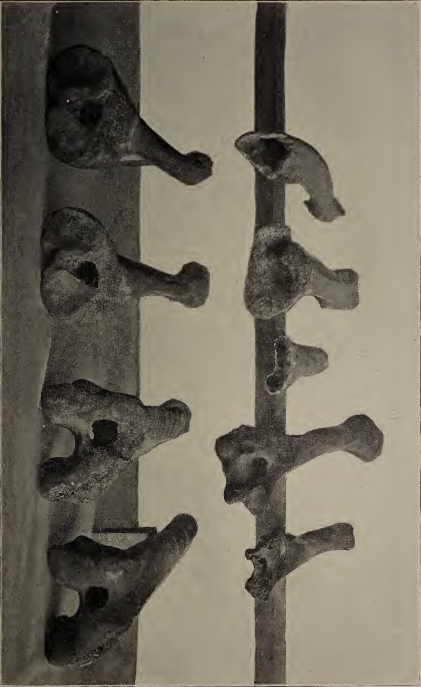
ARTIFICIAL PERFORATIONS TO THE MEDULLA OF THE BONES.